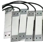
High Precision Weighing Sensor