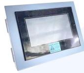
HD Operation Screen