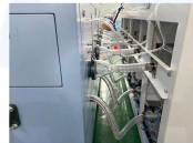
Down Returning System