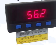
Humidity Control System